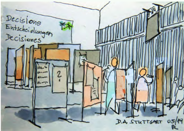
Illustration by © Franz Ryznar

June 18th to 19th: DA Assembly including presentations from Local Chapters and Hubs, Community Building, Open Spaces and Voting